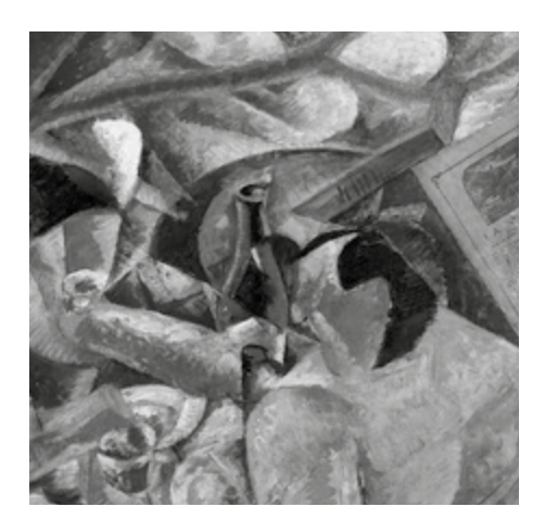
On the cover: graphic elaboration of Sotto la pergola a Napoli (Under the Pergola in Naples, 1914) by Umberto Boccioni, Galleria d'Arte Moderna, Milan.