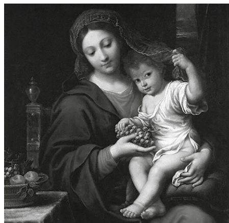
On the cover: Graphic elaboration of Madonna of the Grapes (17 th century) by Pierre Mignard, Louvre Museum, Paris.