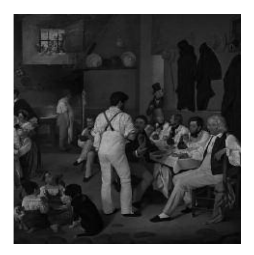
On the cover: Detail from the painting "Osteria La Gensola in Rome", (1837) by Ditlev Blunck. On display at the Copenhagen Museum.