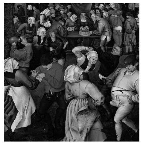
On the cover: Detail from the painting "The Outdoor Wedding Dance" (circa 1610) by Pieter Brueghel the Younger, private collection, USA.